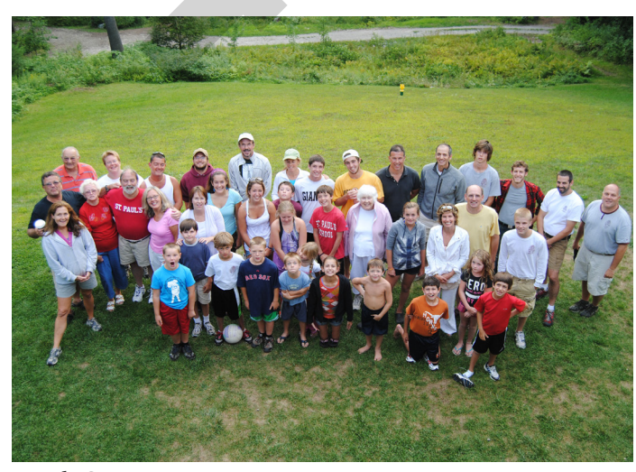
Family Campers 2010

ON August 20, 2011 - We are excited to celebrate Birch Rock's 85th Anniversary. In addition to this historic milestone, we are pleased to open up our annual BRC FAMILY CAMP program to prospective families, alumni and friends from August 19 to 23. So come join us.....for our 85th Celebration Day and/or the Family Camp extended weekend. You'll be glad that you did! For more information about our 85th Anniversary and Family Camp, please visit us at www.birchrock.org or (207) 741-2930.